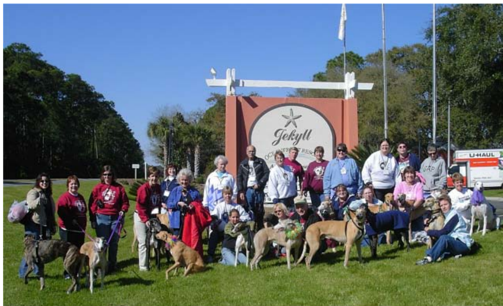
GREAT, Inc., making a strong showing at the 2006 Sandy Paws event!

Reservations for 2007 are being accepted by the Jekyll Inn at (800) 736-1046. The Inn's website is www.jekyllinn.com . There is also a campground on Jekyll Island; for reservations call toll-free (866) 658-3021. Their website is www.jekyllisland.com/where/camping.html . The "official" dates are Friday, March 2 through Sunday, March 4, 2007. From the Tampa Bay area the drive will be about 5 hours. For more information about Sandy Paws, please see www.sandypaws.org .