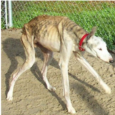
Ziggy - too weak to walk normally

Ziggy is 8 years old (will be 9 in June) and was in frightening shape when GAF volunteers first saw him, but after just a few weeks of regular meals and veterinary care, he has shown amazing improvement.