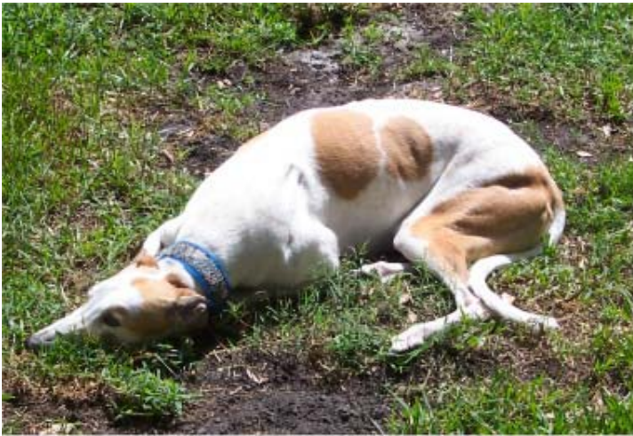
Kelly relaxing in the sun

Those who knew Kelly described her as charming, elegant, a lady, a princess. She was all those things, and she was the best greyhound companion we could have asked for. Losing Kelly has been difficult, but as painful as it is, I wouldn't trade our time with her, however short, for anything. Love is stronger than grief, and I know in time I'll only remember the great moments we had. I'll remember how much she loved meet 'n greets; how she loved the attention, the oohs and ahs she so often received. I'll remember how much she loved to eat and how she started "reminding" us, in her gentle way, that it was time to eat well in advance of meal time. I'll remember how much her brother Dusty adored her and followed her every cue. And I'll especially remember how she always, until the very last day, greeted us warmly, tail wagging, when we arrived home.