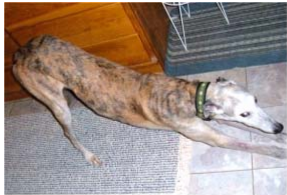
Ziggy - leisurely stretching in the Varnberg kitchen

Ernie will be 5 in September and has an old injury that probably took place at birth or shortly afterward. Nothing can be done to make this leg normal again, but he doesn't let it bother him and in fact, he has no idea he isn't a puppy with four functioning legs. On a recent visit, he took great delight in zooming up behind me and jumping on me when I least expected it, and almost knocked me down a few times!